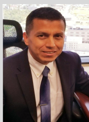
Message from Eduardo Solorzano CoS Administrator

Happy September! With each passing day, we realize that it is not only our students but also all of us who are learning, growing and becoming more comfortable embracing the technological world of distance learning.